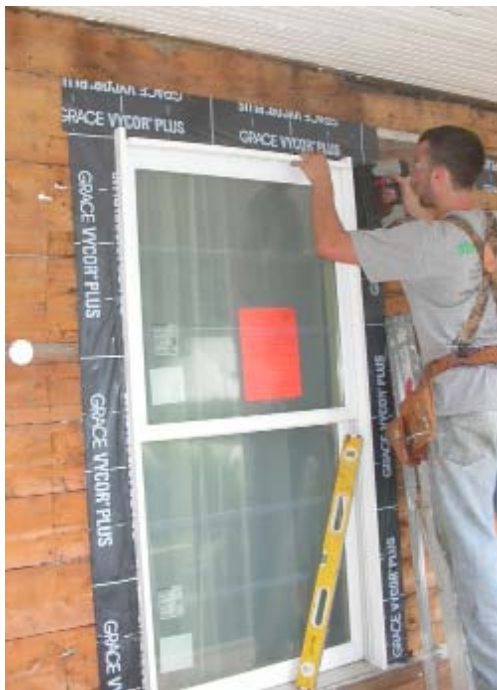
Figure 3. After removing trim from the old windows (this frame was fitted with new jamb liners and replacement sash), crew members filled voids and gaps around the frames with spray foam (A), then taped the frames to the sheathing with self-adhering flashing tape (B). New cedar sill extensions were applied to the sills (C), while the frames were fitted with new 1 3 / 8 -inch-wide Azek jamb extensions (D).