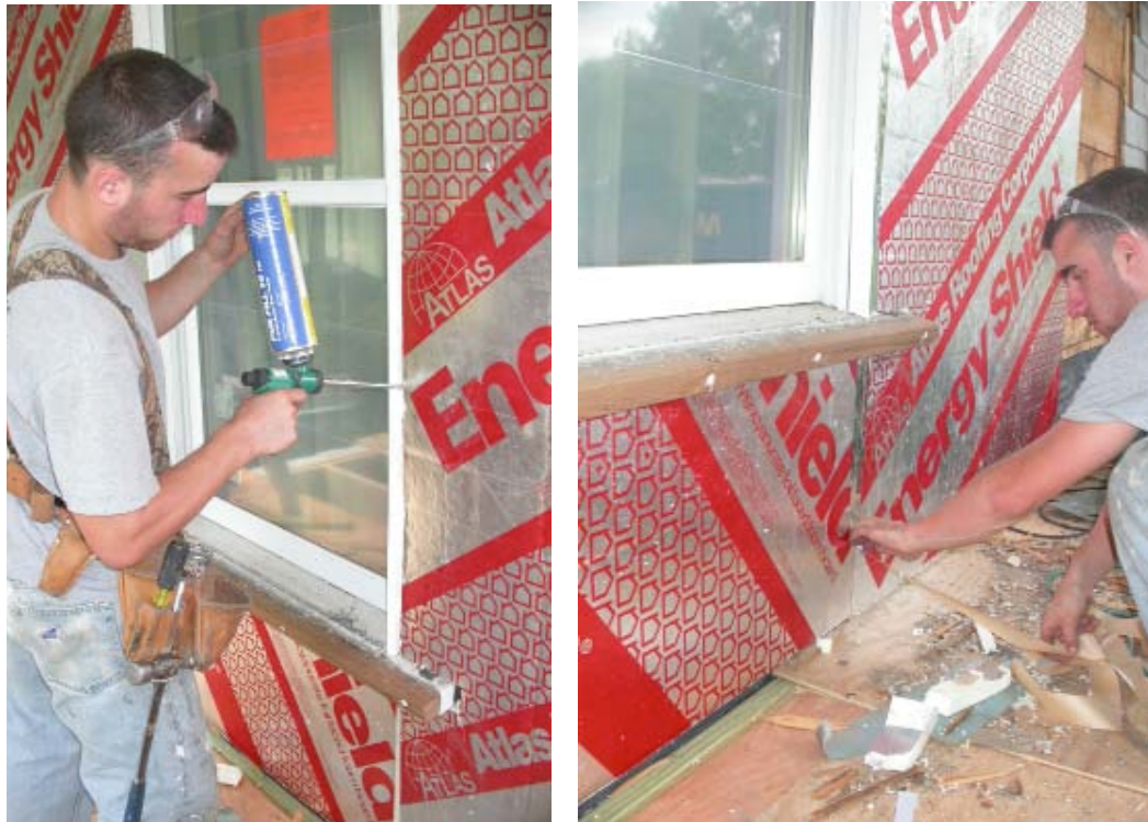
Figure 4. The walls were wrapped with 1-inch-thick sheets of polyisocyanurate foam, which adds R-6 to the wall assembly and acts as an air and vapor barrier and drainage plane. All joints — including gaps between the rigid foam and jamb extensions — were foamed (far left) and sealed with flashing tape (left).

tough to work with, fiber-cement trim boards have milled edges that make it tough to close up the butt joints on corner boards.