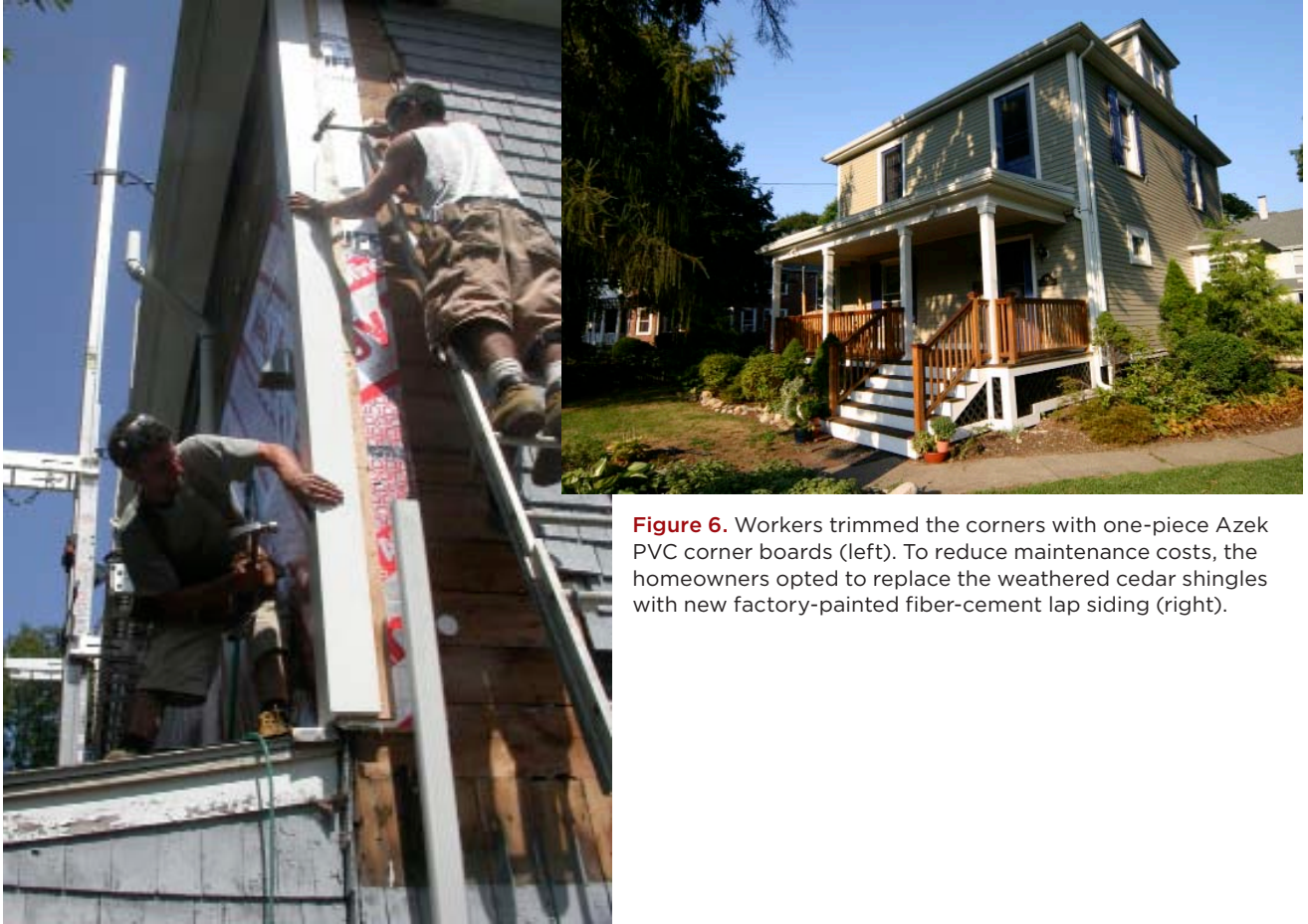
Figure 6. Workers trimmed the corners with one-piece Azek PVC corner boards (left). To reduce maintenance costs, the homeowners opted to replace the weathered cedar shingles with new factory-painted fiber-cement lap siding (right).

The cost of blowing cellulose into the walls was about $2,300. According to the blower-door testing company's modeling software, the cellulose should save the homeowner $687 per year, paying for itself in a little less than 3½ years before any federal tax credits or local rebates.