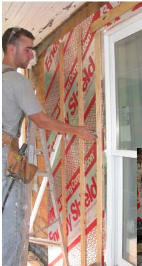
Figure 5. Battens ripped from ¾-inch plywood were fastened through the foam and sheathing into the wall framing to provide solid nailing for the fiber-cement siding and create a drying airspace behind it (left). Strips of ¾-inch-thick Cor-A-Vent installed along the base of the wall between the battens keep out insects (B).